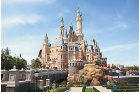
Shanghai Disneyland Park