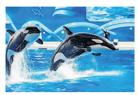
Shanghai Haichang Ocean Park