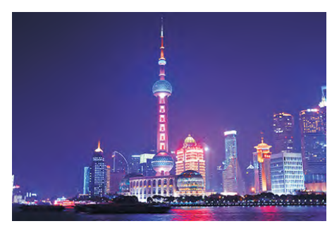
Oriental Pearl TV Tower

Shanghai is one of the most modern cities in China and also has many historical and cultural sites. We have recommended many famous tourist attractions for you. The routes to these tourist attractions can be found through some apps like Baidu Map, Gaode Map, and Google Map.