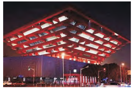
Shanghai World Expo Exhibition and Convention Center